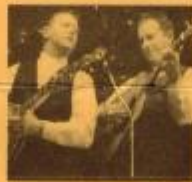
Spinney Brothers (Thursday)