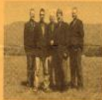
Bluegrass Brothers (Friday)