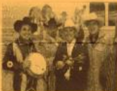
Goldwing Express (Saturday - Special 25 yr. Show)