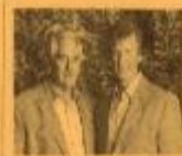
Crowe Brothers (Thursday)