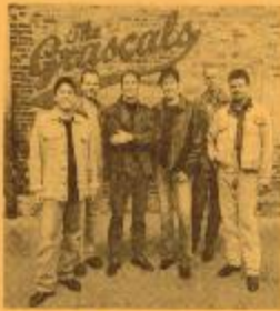
The Grascals (Saturday)