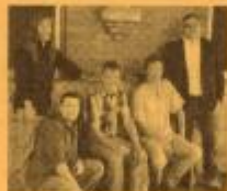
Nothin' Fancy (Friday)