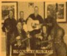
Big Country Bluegrass (Saturday)